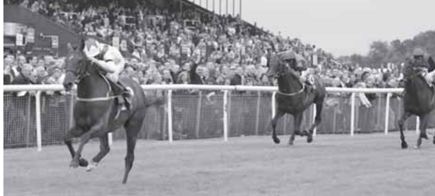
betfred.com Old Borough Cup Stakes (Heritage Handicap), Haydock—Yes Mr President revels in the mud; Alanbrooke (blinkers) and Kings Destiny finish third and fourth respectively