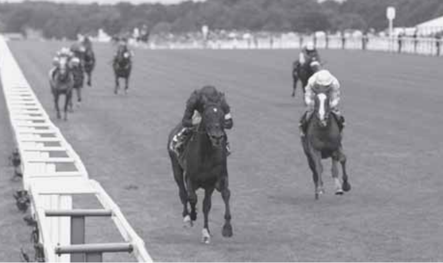
Gold Cup, Royal Ascot—the 203rd year of this great race and Yeats becomes the first to win it four times; Patkai is the only one to finish anywhere near him